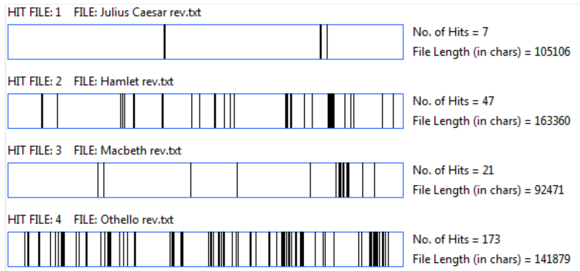
Concordance Plots made with AntConc

These plots don't only show how often the word “she” comes up in the four plays, but also when. Each vertical line is one occurrence of the word, and where it appears in the bar tells us how far in to the play the word is spoken. For example, we can see that “she” appears approximately a third of the way through Julius Caesar and another few times about three quarters of the way through. In comparison, this same word occurs 47 times in Macbeth, and is spread relatively evenly throughout the play.